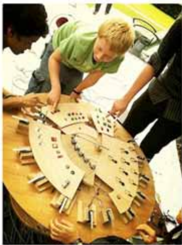
Annabelle (Malasia) instalación

With more than 400 proposals received , a selection was made looking for works with hybrid personality, developed by artists from several origins, that converge in Sound Art and Interactivity with the public.