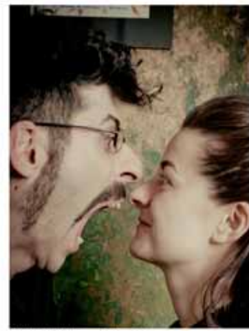
Archipel (España) performance

“We are interested in this mixing, freedom value. The creation of community and linking between artists, the venues, the public and the show”