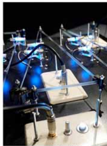
Guillermo Marconi (Colombia) instalación