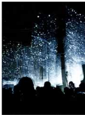
Eztul (México) evento audiovisual